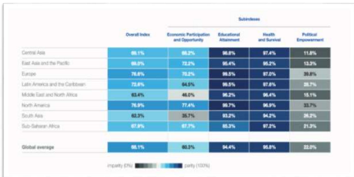
Figure 3 Gender gap closed to date, by region (Global Gender Index 2022, World Economic Forum)

Gender equality is a comprehensive concept that encompasses economic, social, and political empowerment. SAARC encounters numerous obstacles in fostering cooperation and collaboration among its constituent nations. According to statistics issued by the World Economic Forum (WEF) in their Global Gender Gap report for 2022, the gender disparity figures for SAARC countries were the lowest among the other regions. The data is presented in the GGI report (2022) figure below.