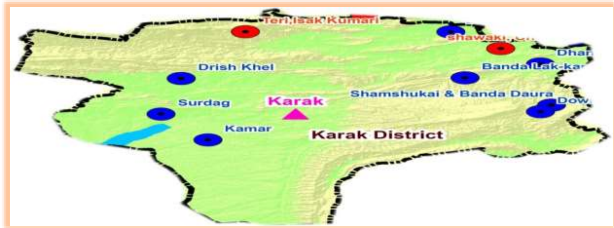
Figure 1: Map of District Karak

One limitation of this research is the geographical scope of the study, which focused solely on the district of Karak in Pakistan. This may limit the generalizability of the findings to the broader population and other regions of the country. Additionally, due to time and financial constraints, the study only included two Tehsils within the district Karak, Tehsil (Takhti-E-Nasrati and Tehsil Karak), potentially limiting the representativeness of the sample and the diversity of perspectives. It is essential to consider these limitations when interpreting the results and acknowledging their potential impact on the comprehensive understanding of the effects of Indian dramas on the culture and language of the Karak district.